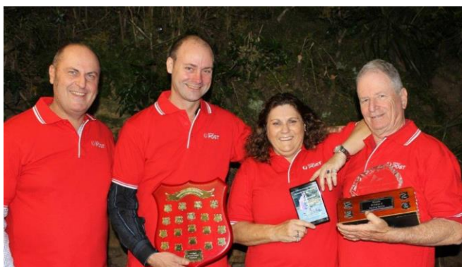
Australia Post sponsored Division 3 Spring Series winners....Xena Warrior Princess.