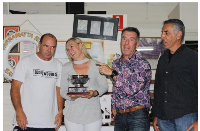
Most improved – Memphis.