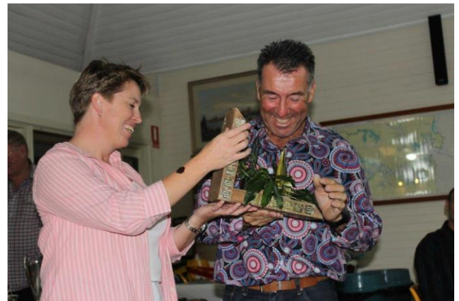
Above is the Flotsam Trophy for coming upon hard times – in this case running into a mangrove tree as per the trophy.....Memphis.