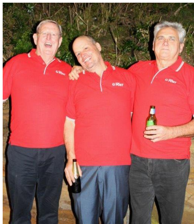
Australia Post Division 1 Spring Series winners.....the three tenors.....aka Axis of Evil.

PRSC welcomes new skippers and crew - see www.prsc.org.au for details - or attend the club at the end of Wharf Road Gladesville any Saturday afternoon scheduled races are on. July 2017.